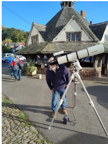
Terry Evans

Address: Yarn Market Hotel, 25-33 High Street, Dunster, Somerset TA24 6SF (Tel 01643 821425)